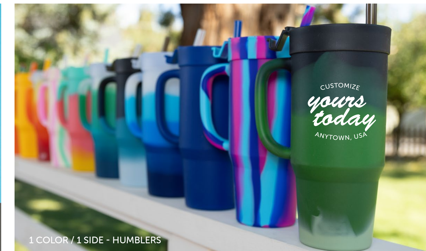
1 COLOR / 1 SIDE - HUMBLERS