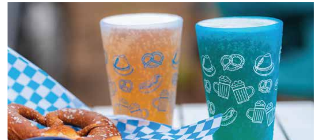
1 COLOR WRAP - ICICLE / AQUA PINT