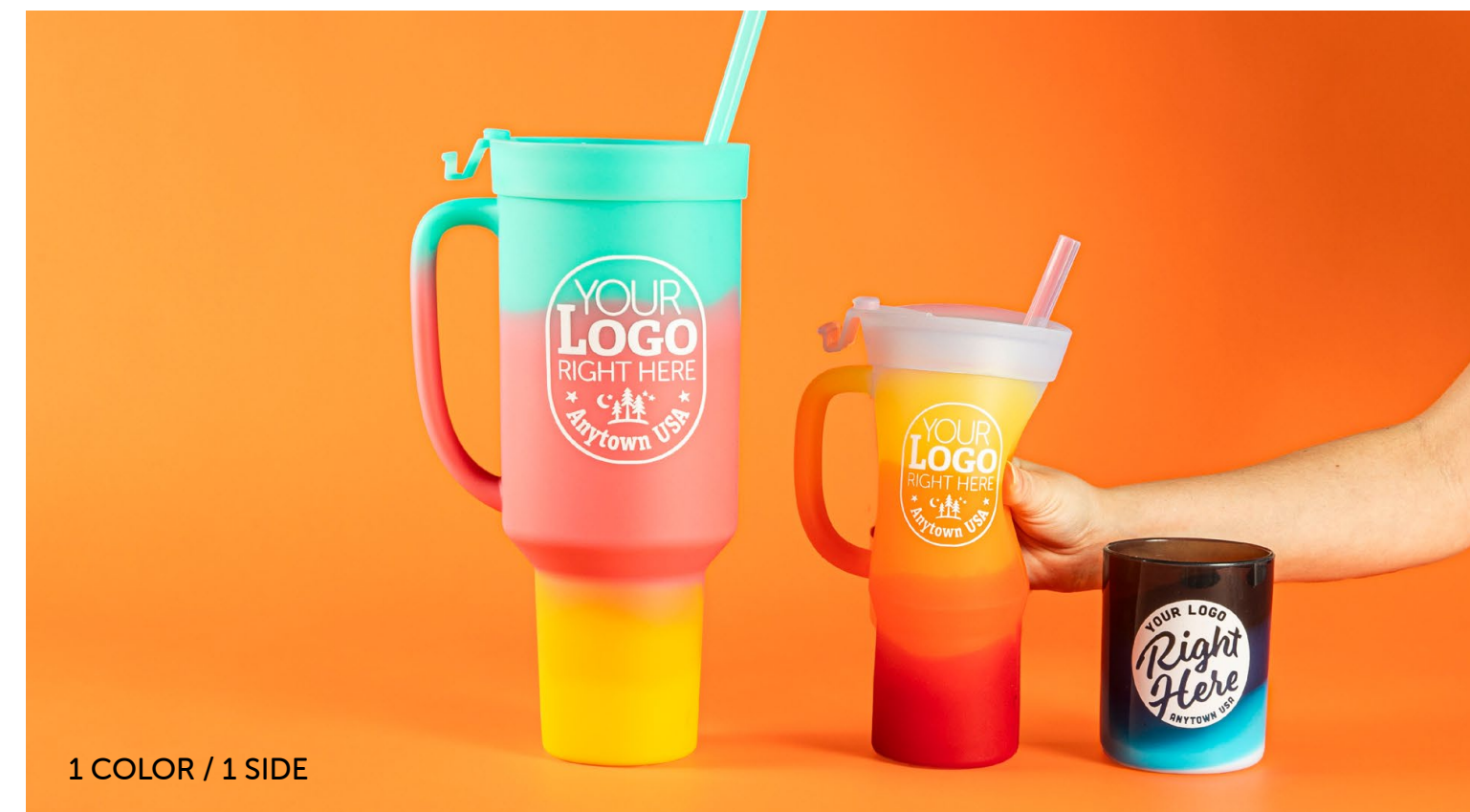
1 COLOR / 1 SIDE