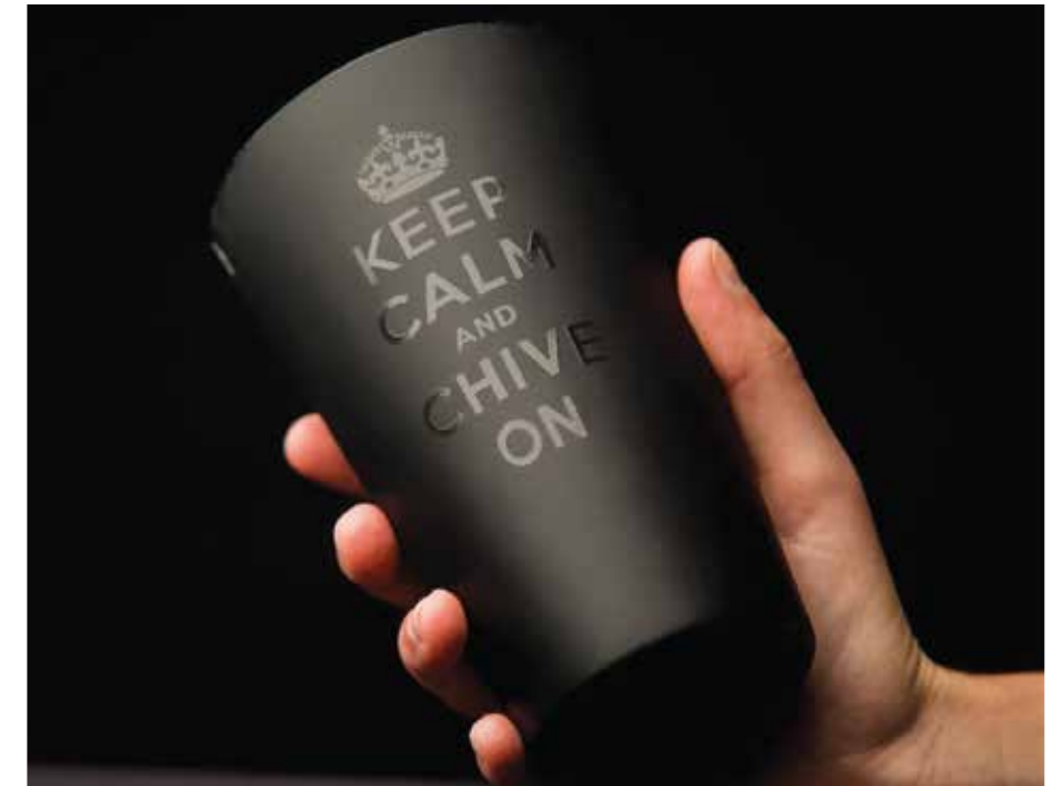
1 COLOR / 1 SIDE - CLASSIC BLACK PINT