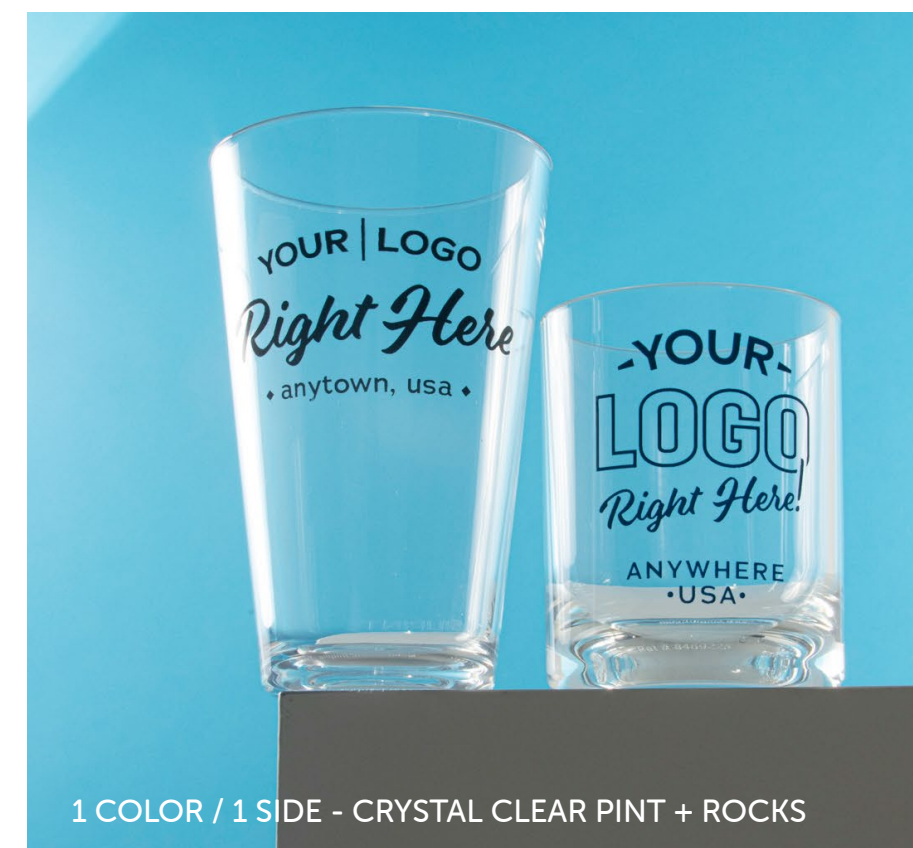
1 COLOR / 1 SIDE - CRYSTAL CLEAR PINT + ROCKS