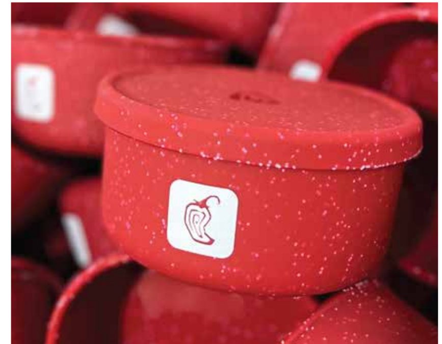
1 COLOR / 1 SIDE - SPECKLED RED LIDDED BOWL