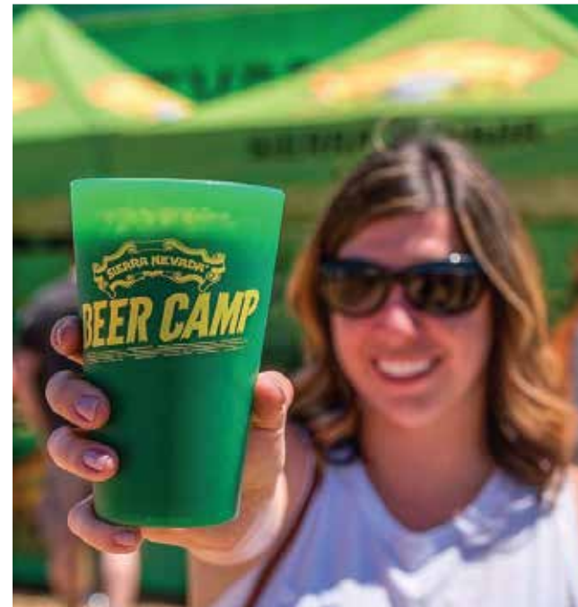
1 COLOR / 1 SIDE - CLASSIC GREEN PINT