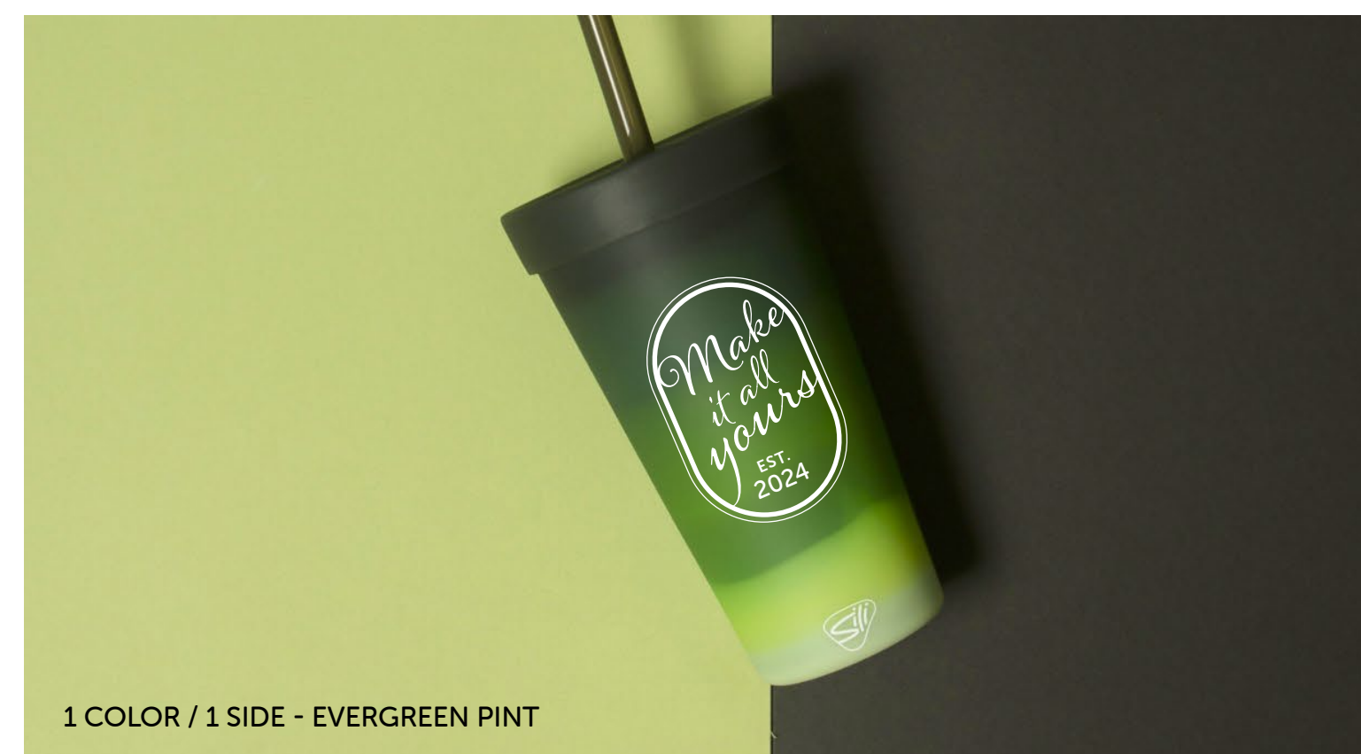
1 COLOR / 1 SIDE - EVERGREEN PINT