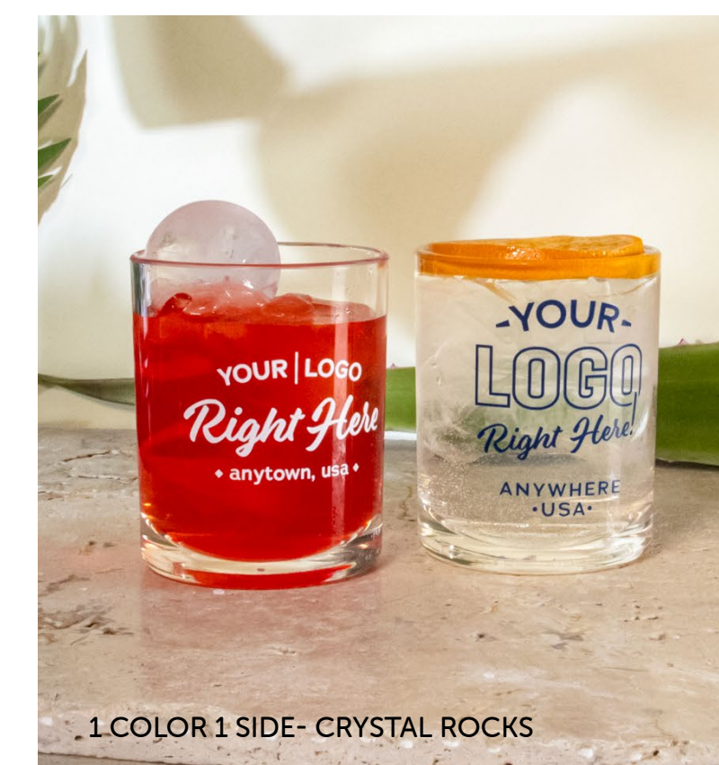
1.COLOR 1 SIDE- CRYSTAL ROCKS