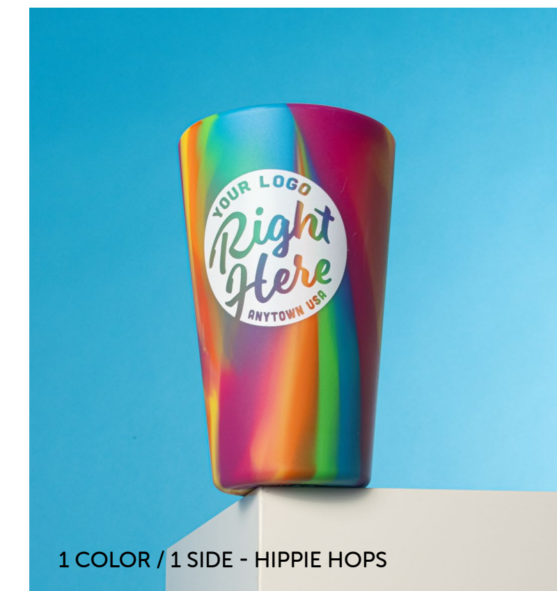
1 COLOR / 1 SIDE - HIPPIE HOPS