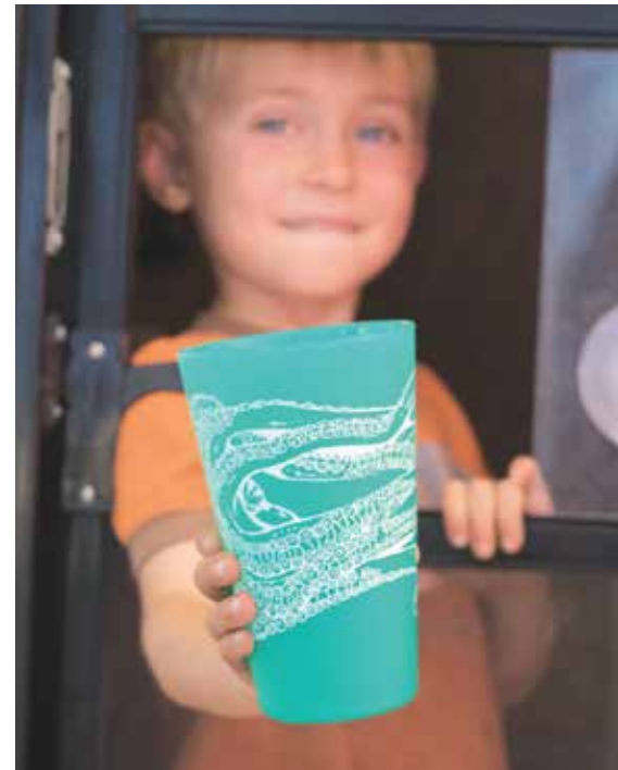
1 COLOR WRAP - AQUA PINT