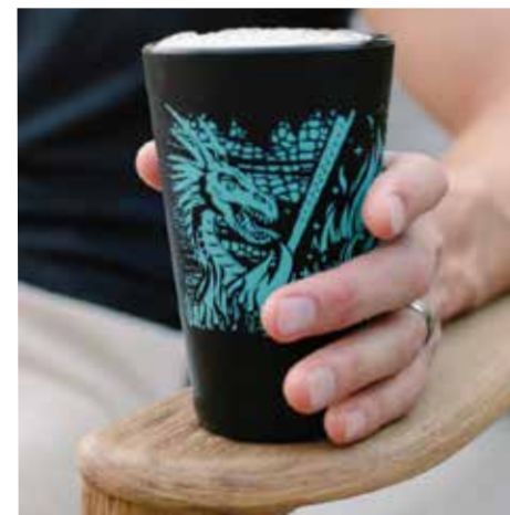
1 COLOR WRAP - CLASSIC BLACK PINT